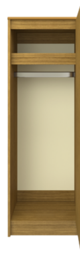
Model: ATWR01R 23.75W 23D 71H

The Atlanta Collection features softly rounded edges and waterfall detailing. Transitional styling make this ideally suited for a wide range of environments. Choose from dozens of hardware styles, including ADA-compliant and soft pulls. Atlanta is customizable and available in various sizes to suit your space.